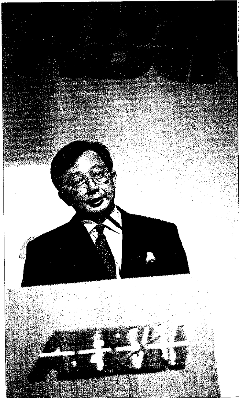
Thai publishing tycoon Sondhi Limthongkul: Visionaries aren't always the best managers.

Sondhi Limthongkul's dreams have grown beyond his means. To convince international investors to finance his Asian media empire, he has to get his house in order.