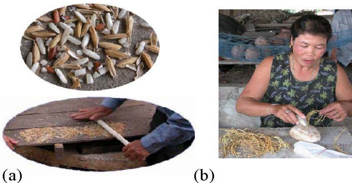
Fig 3. Evaluation of rice quality by (a) paddy crushing, and (b) examination of representative grains in each panicle for seed selection.

Thailand's rice export market is highly diverse, and export destinations include almost all countries in all continents. Of the top 12 importers of Thai rice (Nigeria, Senegal, South Africa, China, Iran, Iraq, Indonesia, Benin, Côte d'Ivoire, Malaysia, the USA and Hong Kong, in that order, based on 2001 to 2006 average import volumes) which together take two thirds of the total annual export, each accounts for a share of only 4-8%. Virtually all of the parboiled rice produced is exported, mainly to the Middle East and Africa. Even though China has been so successful with its own green revolution that the country now exports some 2 million